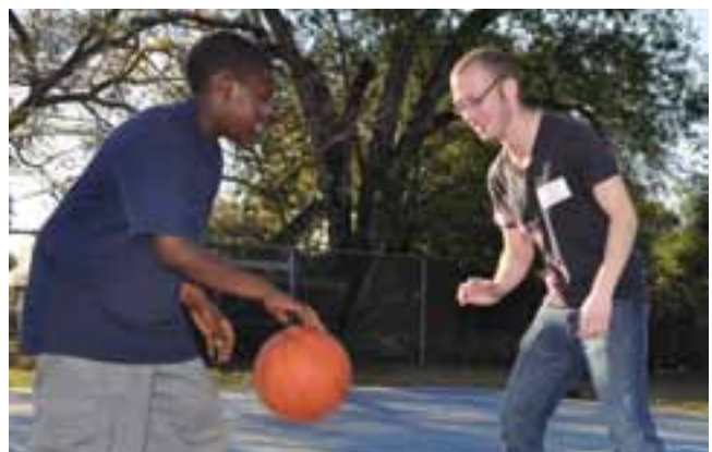
UT joined with the University of Memphis in the Leadership Exchange, in which students studied social justice issues and participated in community service.

This year we continued programmatic development for the $1.3 million Helios Grant that focuses on minority and/or first generation, Florida residents and