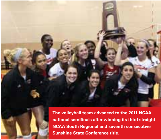
The volleyball team advanced to the 2011 NCAA national semifinals after winning its third straight NCAA South Regional and seventh consecutive Sunshine State Conference title.