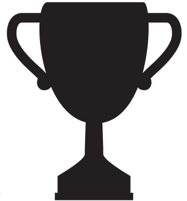
UT won two national championships in 2014-2015 bringing the total to 15.

Finally, while the city of Tampa introduced its bike rental program in downtown Tampa this year, UT's five-year-old free bike loaner program, BikeUT, grew by 56 percent to 4,051 loaners during the year.