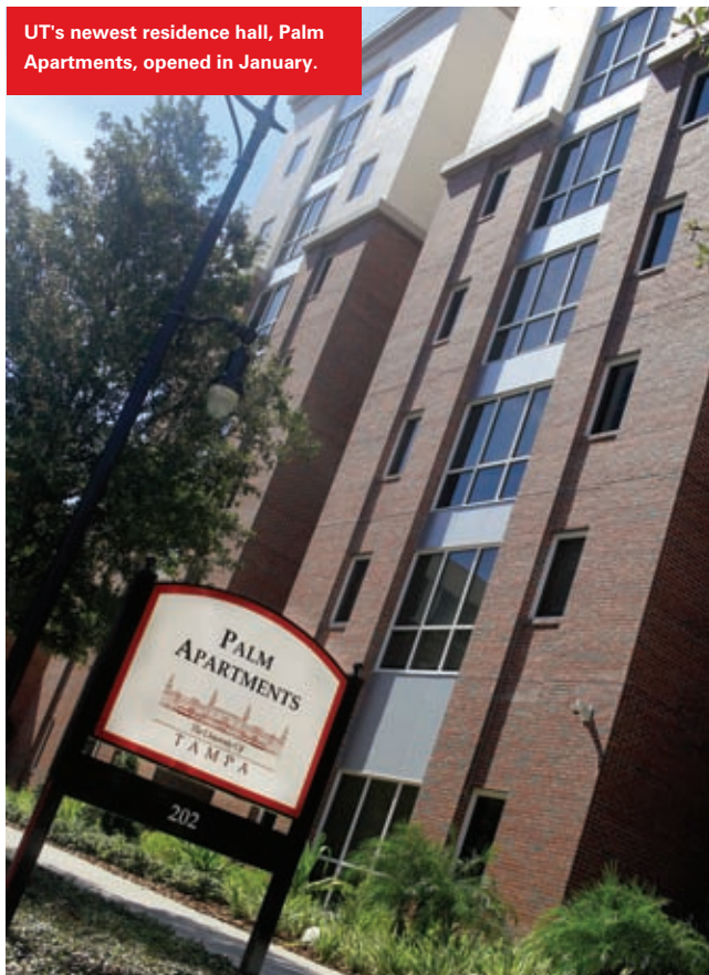
UT's newest residence hall, Palm Apartments, opened in January.

planned gifts and pledges received was about $39 million. This is about double our previous high. You can browse a couple pages further in this issue and see the lists of individuals who share our vision for The University of Tampa.