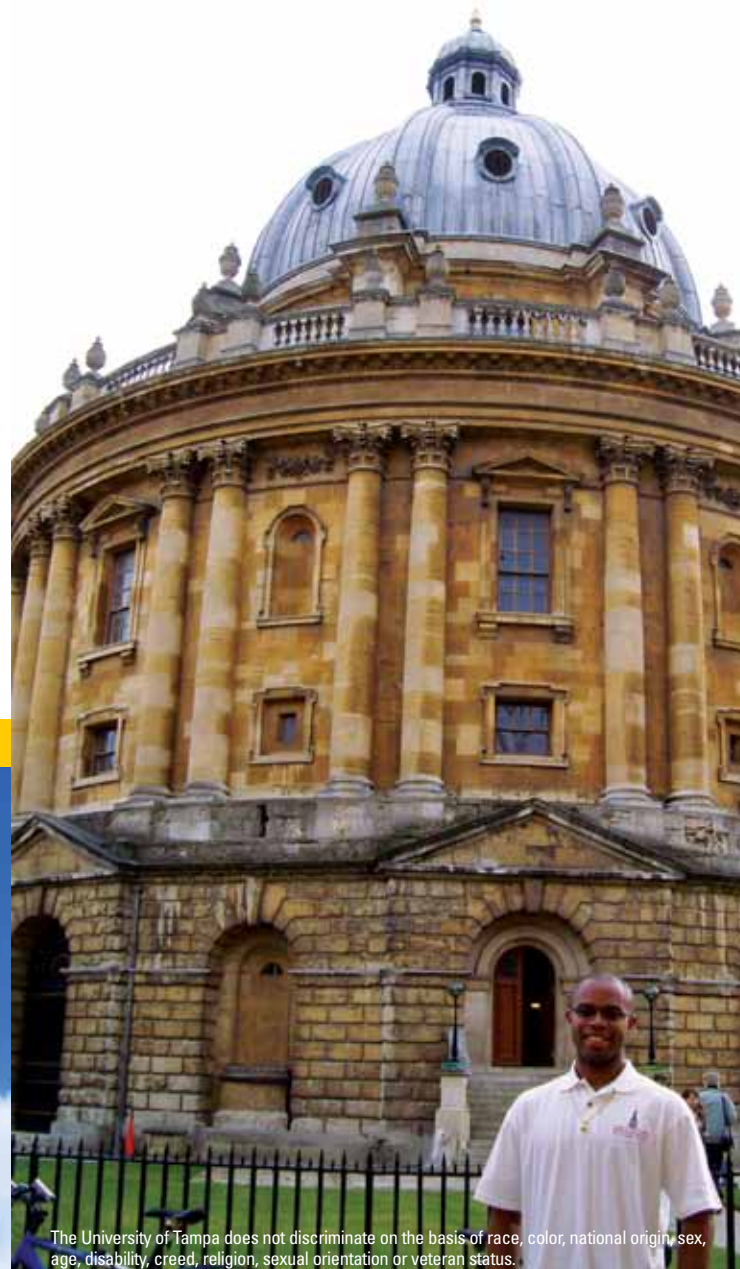
The University of Tampa does not discriminate on the basis of race, color, national origin, sex, age, disability, creed, religion, sexual orientation or veteran status.

Studying abroad will be among your most rewarding experiences in college. You'll make lifelong friendships, build confidence and independence, and gain new perspectives that will enrich your remaining years at UT, your career and your life.