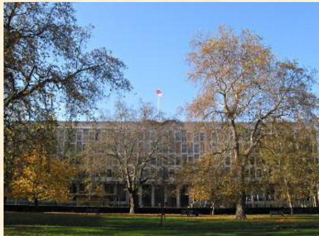
US Embassy in London

You can work for the federal government in any of the 50 states or in one of the 180 countries where the US has a State Department embassy or consulate. In fact, 84 percent of all federal jobs are located outside Washington, DC.